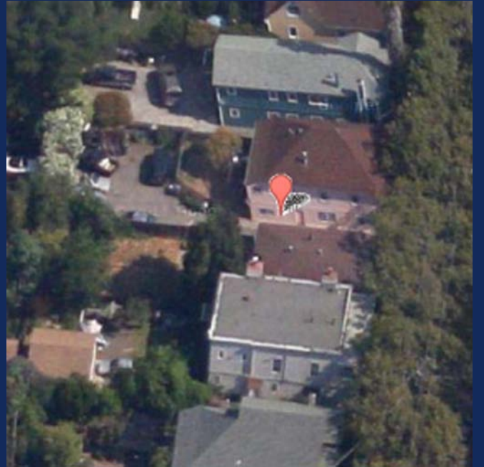
327 C Street Satellite Map